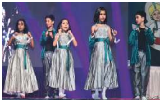
Annual Day Programme