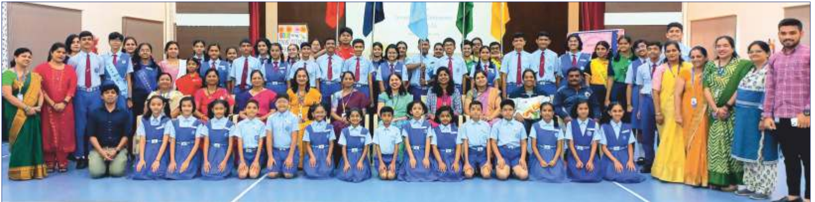
The Student Council (2023-24)