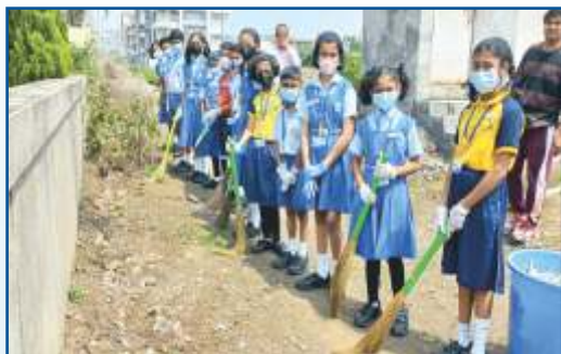
Students and Faculty Regularly Participate in Cleanliness Drives