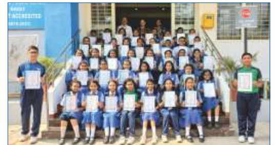
Winners of the Intermediate and Elementary Drawing Competitions