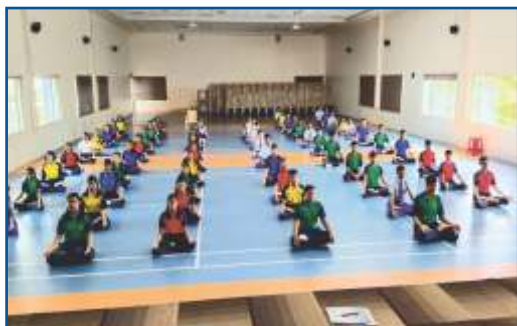
Celebrating Yoga Day