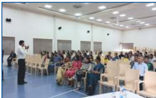
Career Guidance and Psychometric Testing Sessions are Periodically Conducted Throughout the Year