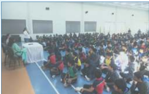
At the Gender Sensitisation Programme