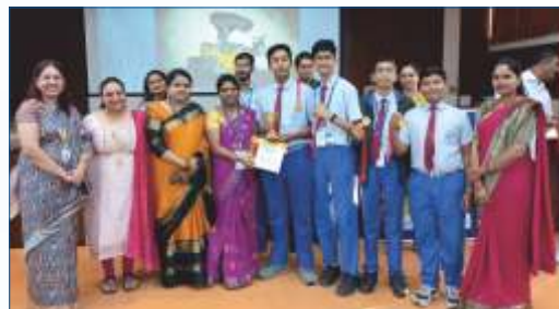
At the RoboCup Junior Nationals