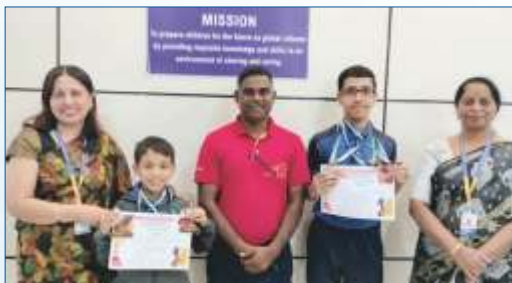
Winning the Skating Competition