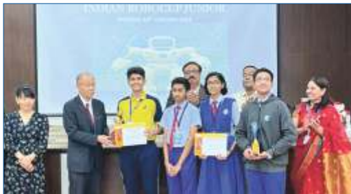
At the RoboCup Junior Regionals