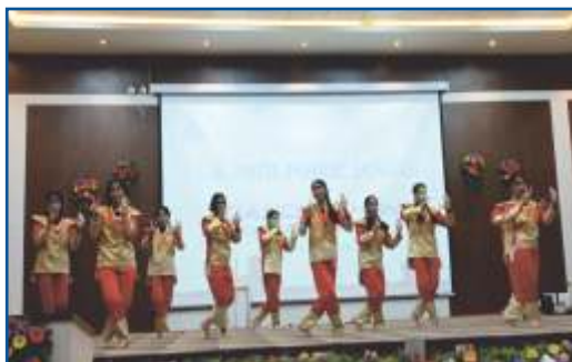
S. B. Patil Public School Hosted the Danceathon Inter-school Dance Competition