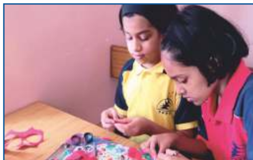
Life Skill Classes are Held Throughout the Year