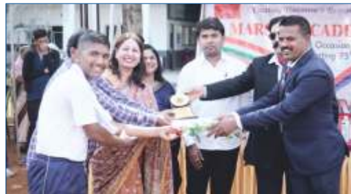
Commemorating Indian Army Day