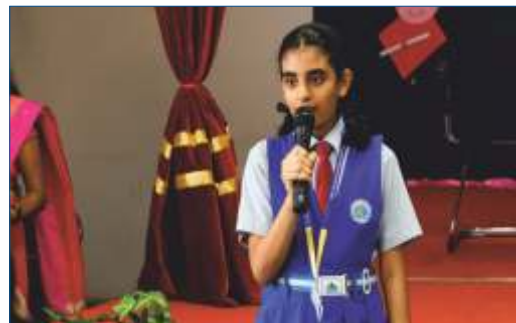
Students Participating in an Inter-School Extempore