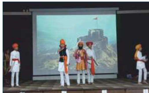
Celebrating Chhatrapati Shivaji Maharaj Jayanti