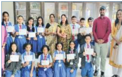
Participating and Winning the Sanskar Prathishthan Singing Competition