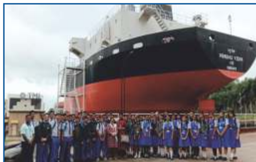
Students at a Field Trip to Tolani Maritime Institute