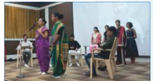
Celebrating Marathi Bhaasha Diwas